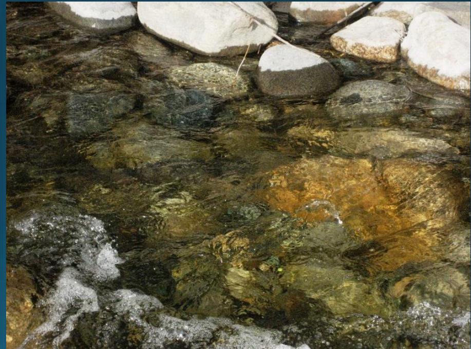
Fish Flows Return to Salmon Creek