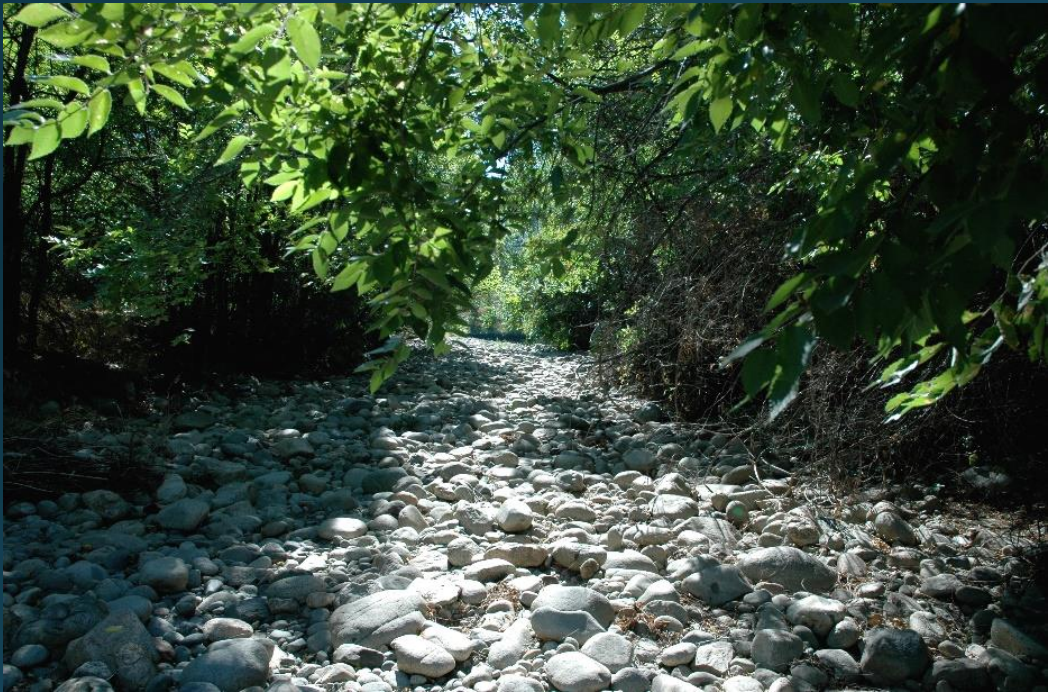
Salmon Creek – Dry